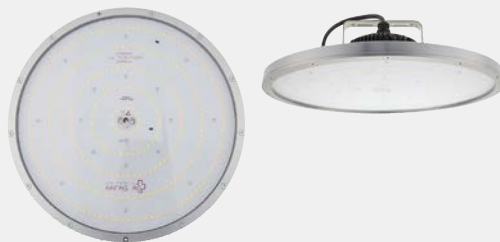
LED ceiling lights Round 340 / 380 / 440