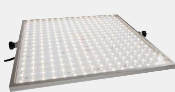
LED ceiling lights Quatt